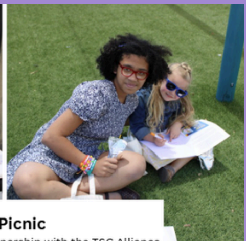
TSC Picnic Hosting a TSC picnic in partnership with the TSC Alliance & Dell Children's Comprehensive Care Clinic